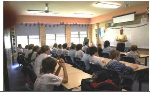
Year 6 students sampling High School classroom