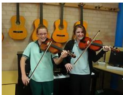
Northlakes High School Violinists

Congratulations to the 25 students selected to represent our School and be part of the choir. We also had 2 dance groups selected and for the first time 2 violinists. We look forward to watching the performance later in the year.