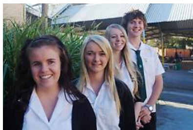
Northlakes High School Debating Team