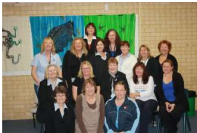
School Administrative Support Staff

Our next P&C Meeting is Tuesday 23 rd August, at 3.30pm in the Language Centre, please come along and find out what is happening in our School. Last week we provided a cake for all of the SAS (School Administrative Support) Staff to appreciate everything they do in the School.