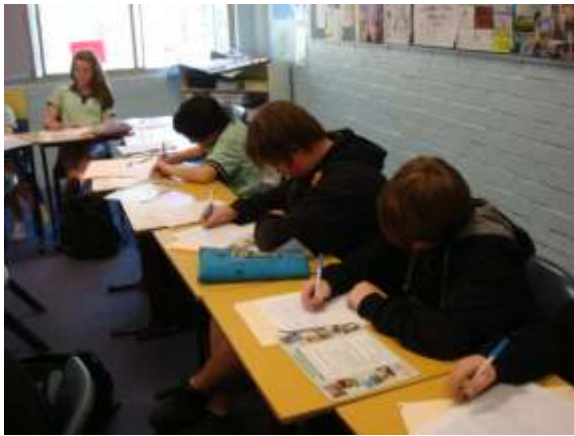
Year 7 students