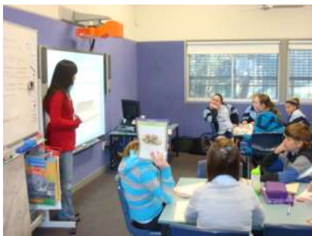
Bluehaven Primary School Year 6 Students