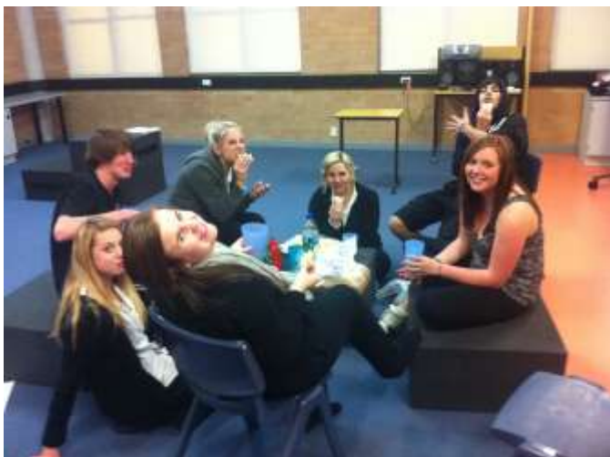
HSC Drama students working hard on a Friday afternoon