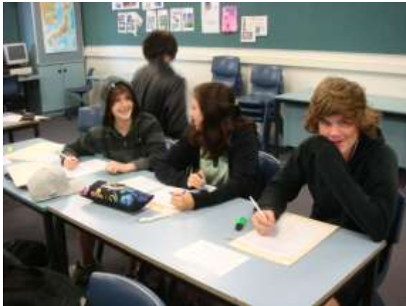
Year 8 Students