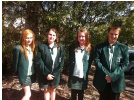
Year 7 Debaters