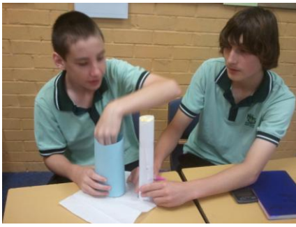
Year 10 students comparing the volume of cylinders using popcorn