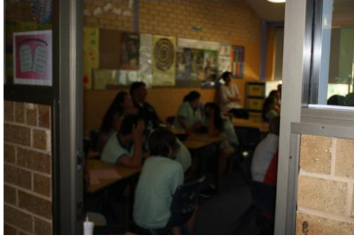
Students at the Numeracy Workshop