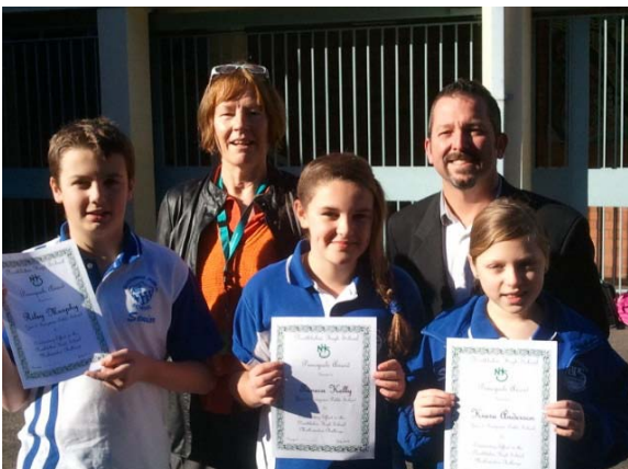
Staff and students from Budgewoi Public School

This is the first year that Northlakes High has run a numeracy competition with our three partner primary schools using edmodo with Year 6 students. Many of the students (and some teachers) have worked hard on improving their numeracy skills throughout Term 2 by answering quizzes and challenge questions. Blue Haven Public won the trophy for their Term 2 effort, and will retain the trophy until the start of Term 4.