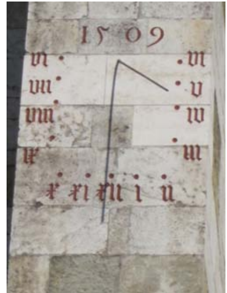
This is a clock from 1509 in a little town in Austria.