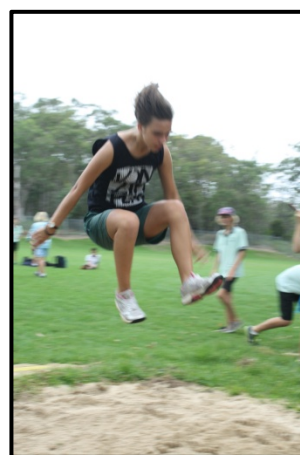
A student competing in the long jump

Monday, we were able to finish all events on Wednesday afternoon. I greatly appreciate the support and effort of all staff involved.