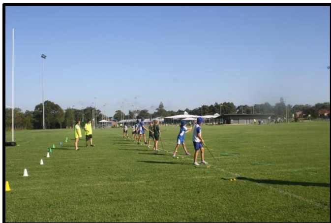
Students participating in the Premier's Sporting Challenge

Blue Haven Primary School. Students from years 5 and 6 from Blue Haven Primary, Budgewoi Primary, Northlakes Primary and Toukley Primary, along with selected year 7 and 8 students from Northlakes High, were put through a series of workshops from some of our year 9, 10 and 11 students.