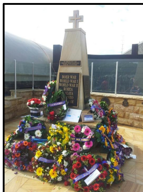
ANZAC Day 2013

Anzac Day falls on the last Friday of the holidays, and we have students marching and representing the school. If your child would like to participate please meet outside the Doyalson Church at 8:15am for an 8:30am march. Please make sure your child is in full school uniform.