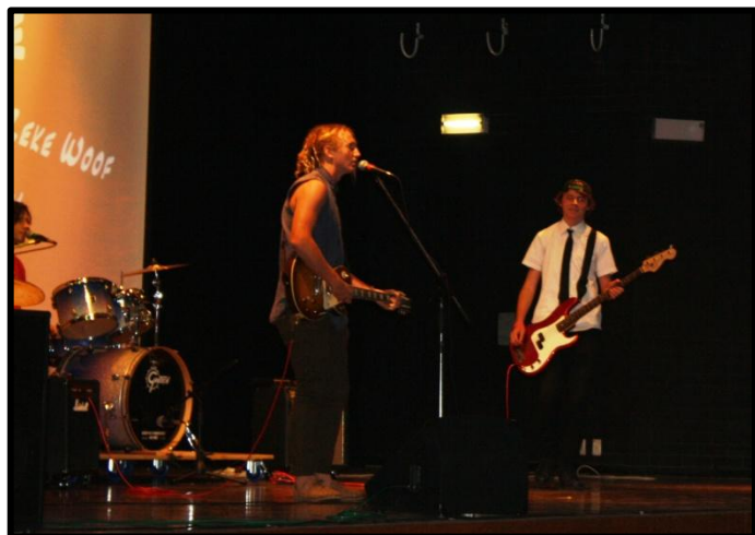
Students performing at the House Day Concert

We have celebrated a very busy and successful first term with a Harmony and House Day. Of course, our winning house of the term, Dilkara, went to the Royal Easter Show. This is a reward for their outstanding effort in earning over 19,000 points for excellent attendance, effort in class, participation, presentation and leadership..... all highly valued qualities. The remainder of the school was involved in a variety of activities linked to our Positive Behaviour for Learning goals of Respect, Responsibility and Personal Best. This was topped off by a concert showcasing some of our very talented students. Hopefully, everyone also had fun!