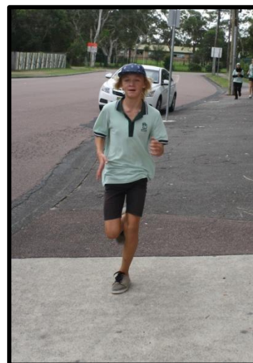
A junior student participating in the Cross Country

It was great to see the involvement of students. Year 8 especially deserves a mention!