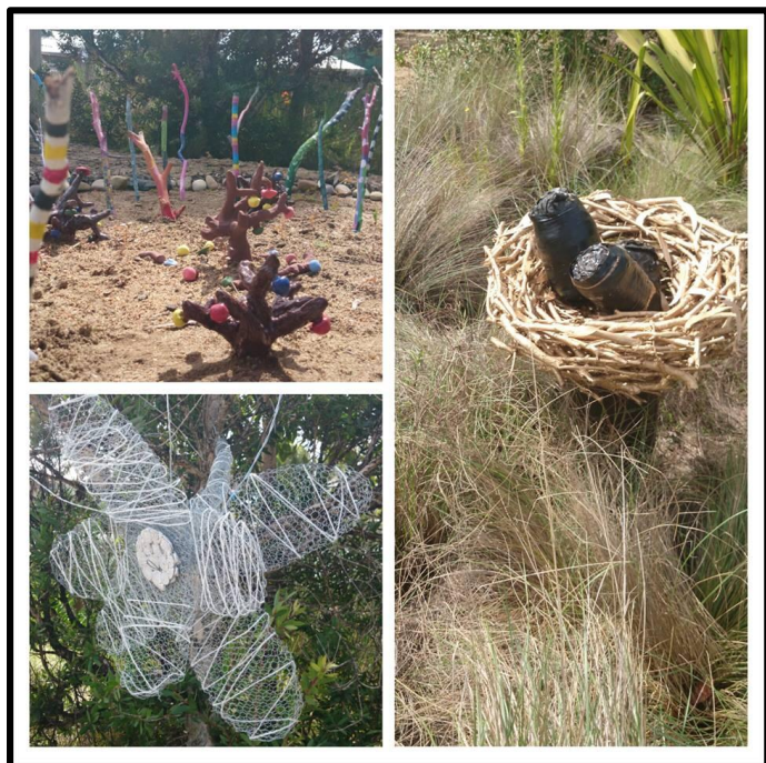
Some of the sculptures at "Sculpture on the Greens"