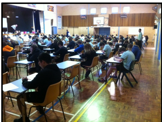
Year 9 during NAPLAN testing

We have had a very good start to Term 2. Years 7 and 9 have completed the NAPLAN tests. Staff were impressed with the motivation and effort of most students. While this is only a couple of hours from a student's year, the data does provide us with valuable information about our progress in helping individual students, as well as whole year groups. In our recent 'Tell Them From Me' survey results; students reported increased awareness of explicit teaching in all curriculum areas. Hopefully this will also be reflected in student results.