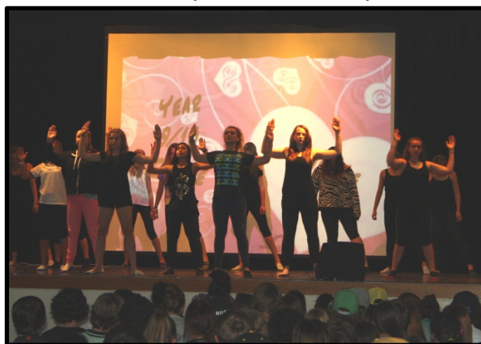
Year 9 Dance students

In Week 3, all Year 9 students sat the NAPLAN test. I was most impressed to see and hear reports of excellent behaviour from students. Well done Year 9 – your hard work and concentration will pay off with your results! Year 9 Dance students have been working hard for their upcoming Starstruck performances. I was lucky enough to see the dances at last terms concert. The groups were wonderful and really a credit to their year.