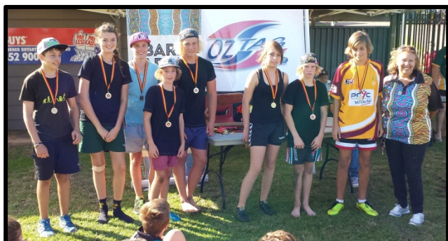
The Northlakes Junior Oz Tag Team

made up with indigenous, non-indigenous male and female students. The junior team went through undefeated, and unfortunately lost the Grand Final 5-4 after going into extra time.