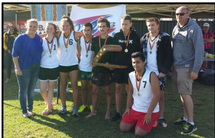
Northlakes Senior Indigenous Oz Tag Team