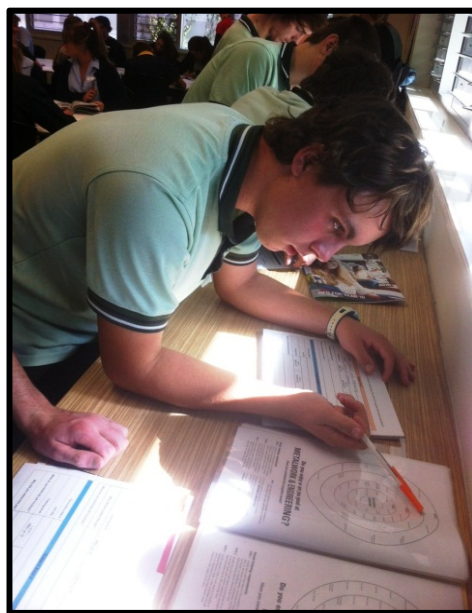
Year 10 students at the Newcastle University's Ourimbah Campus

Year 10 visited the Ourimbah campus of Newcastle University with the Next Step Up program which we are involved in.