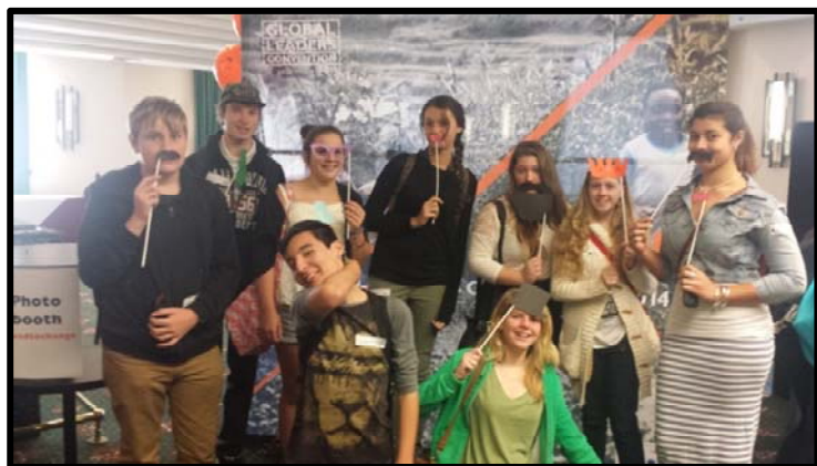
Students at the Global Leaders Convention

In Week 4, ten students from Year 7 to Year 10 visited Newcastle Town Hall as part of the Global Leaders' Convention run by World Vision. At this convention, our students learnt what it means to be a global citizen and how they are able to help with some of the issues our world is facing today. As part of this meeting, our students agreed to participate in the 40 Hour Famine this year and will ask other students in the school to become involved later in the term.