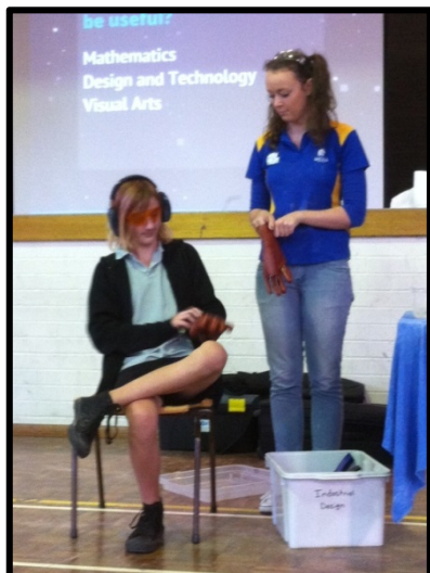
A Year 7 student assisting with the Science experiments

A busy start to Term 2 so far. We have had the Aim High team from Newcastle University visit all our Year 7 students for their Career day with the University.