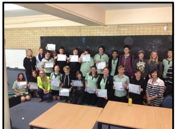
Some of our Year 9 QuickSmart students with their tutors