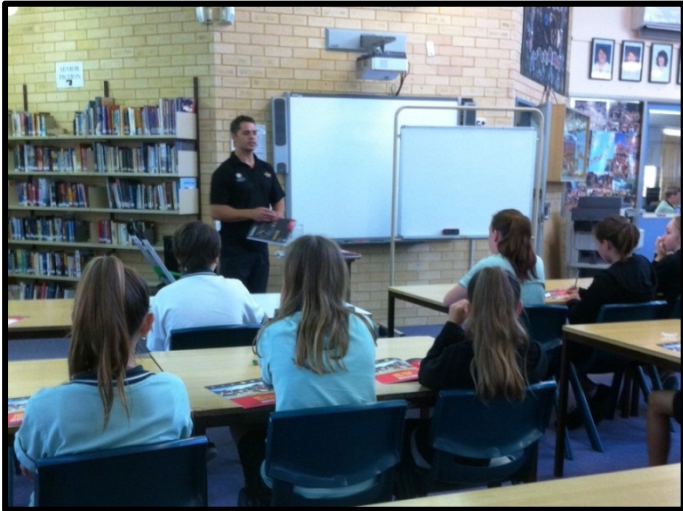
Year 7 & 8 students at the Indigenous S2U I Believe programme

Years 7 and 8 have both had two intense days with Wollotuka the Indigenous S2U I Believe programme from the University of Newcastle.