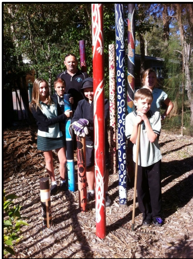
Some of our students working in our Aboriginal Garden

Today Northlakes High School celebrated Reconciliation Week, and spoke about reconciliation, and about building relationships between the wider Australian community and Aboriginal and Torres Strait Islander peoples for the benefit of all Australians.