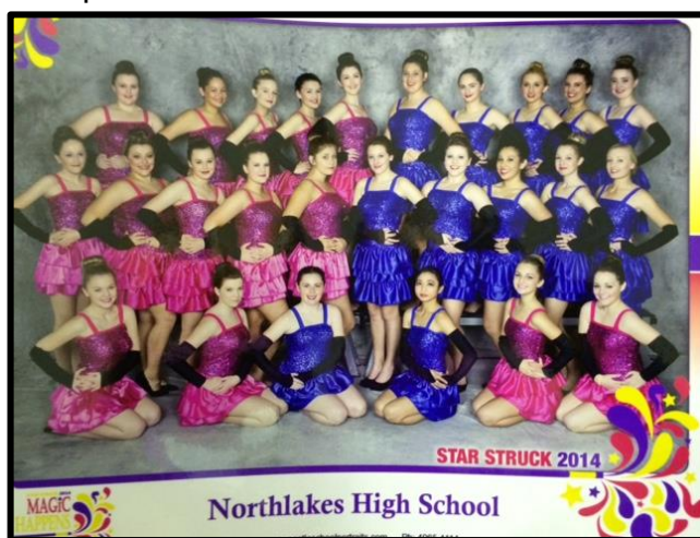
Students at Starstruck 2014

The dancers of Northlakes High School have had a huge term of rehearsing and performing for StarStruck and the Central Coast Dance Festival. I would like to congratulate them on their behaviour, their commitment and dedication and of course their overall quality of their performances.