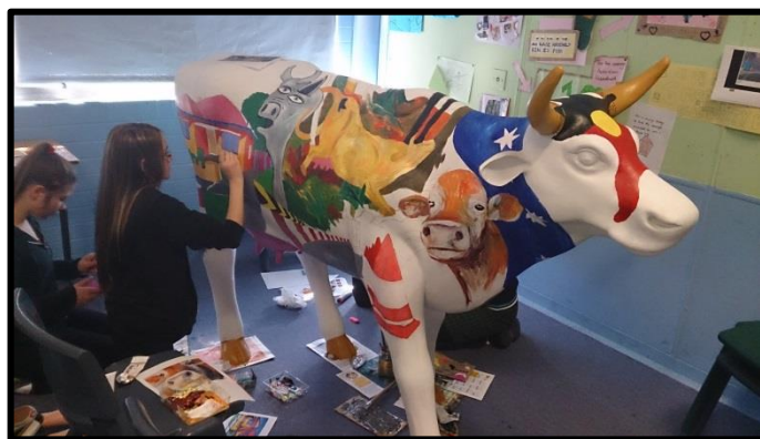
Students working on our Archibull entry for 2014

Northlakes High School has been selected as one of 42 schools participating in this year's Art4Agriculture Archibull Prize, which runs across primary and secondary schools in Queensland, New South Wales and Victoria. The Archibull Prize is an innovative and fun program which engages students in agricultural and environmental awareness through art, design, creativity and teamwork.