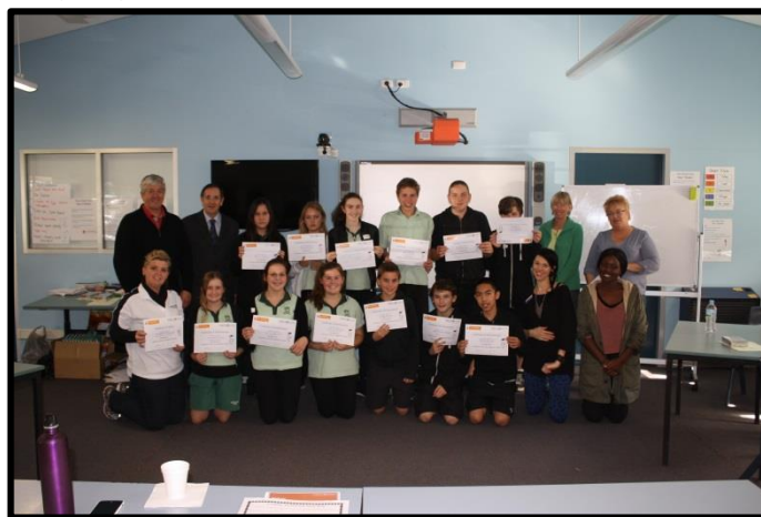
Students taking part in the New Beginnings Program

The New Beginnings program offered through the Department of Community Services in partnership with the YWCA team ran the Leadership program for Year 8 students in the language centre.