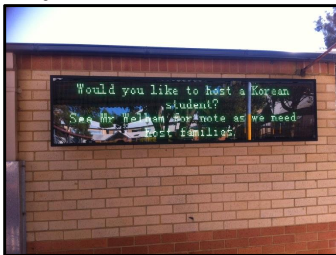
Our new electronic sign

We have, with the financial assistance of our fantastic P. & C., installed an electronic sign on the main quadrangle. This means daily and immediate notices can be put up; it is a significant addition to our communication strategies in the school.