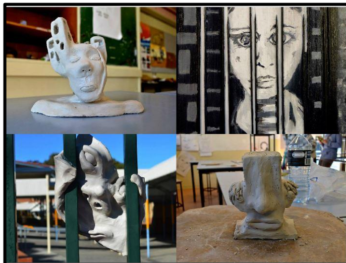
Some of the artworks created during the workshop.

creation of their unique works of art. The finished pieces will be entered in a competition later this year and I hope that selected works will be given the opportunity to exhibit. These students should be commended for their efforts!