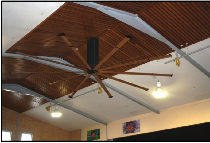
Our new fan purchased by the P & C

We have committed more funds to help pay for new advertising on a Busways bus for the next year. Last year's bus was well received within the community and we believe it creates a sense of pride within our school community. Please look out for this in the near future.