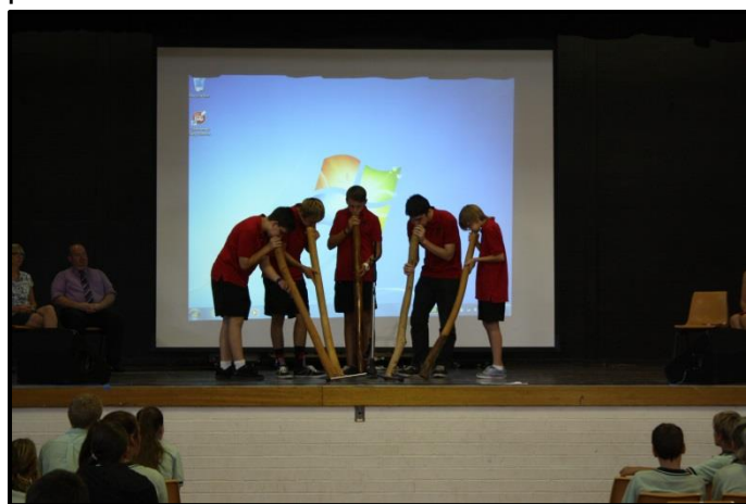
NHS Didge Group performing at our assembly

Last week NHS conducted Stage Assemblies where students were awarded with Year Advisor Awards for positive attitudes to school and excellent attendance. Students from NHS Aboriginal Dance Group, NHS Didge Group and CAPPA faculty showcased their performances.