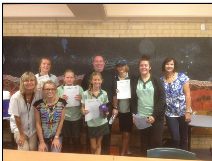
The QuickSmart Presentation Ceremony 2014

The 10 week intensive QuickSmart program for 2015 will finish at the end of Term 1 and in Term 2 the 30 week program will commence. QuickSmart has been an extremely successful program at Northlakes High with 64 students graduating last year.