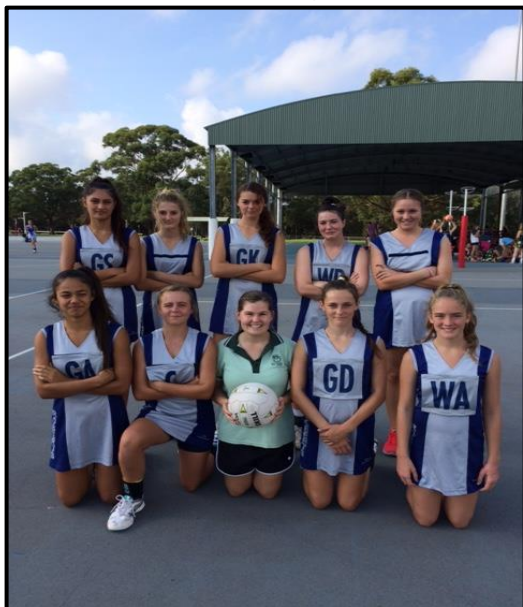
Our Open Girls Netball Team

The Open Girls Netball have had an extremely successful start to the year with three wins within three days. Although hastily thrown together late last week, the girls have gelled beautifully to deliver some excellent performances. Largely consisting of junior students, the team has compiled wins over Narara Valley and The Forrest, and completed the hat-trick of victories with a tightly fought battle over Asquith Girls High.