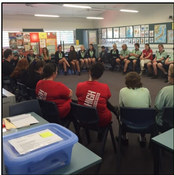
8GQ in a mentoring session with University of Newcastle students

visited all groups and was very impressed with their involvement and interest in the programs.