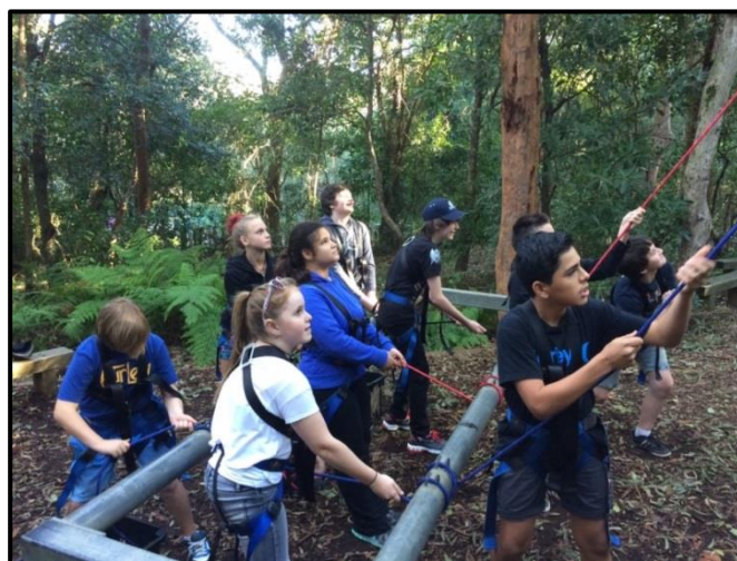
Year 7 students participating in activities at camp